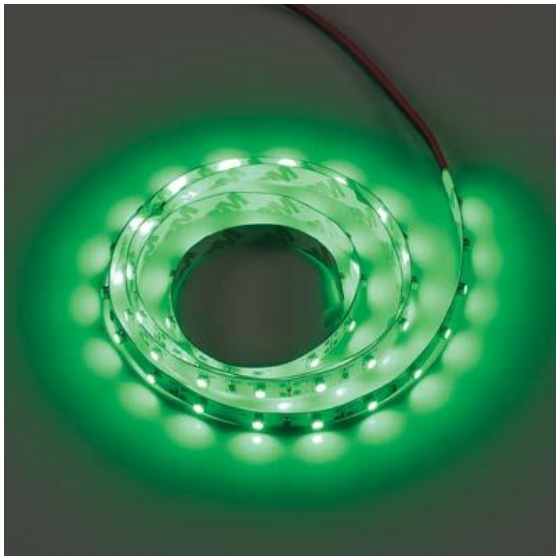
Stick-on LED Light Strip (Green, 5meter). Stock # LXFDXZ (Also have White, Red and Blue)