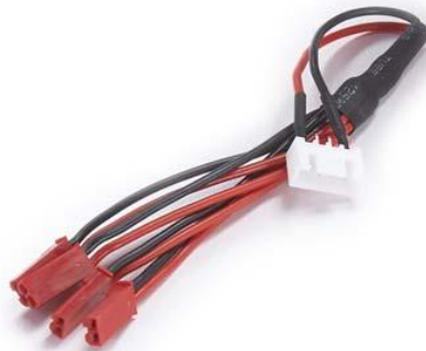
Harness to connect from 3s Lipo Battery Balance Connector to LED Light Strip Leads. Stock # RGZQ3001