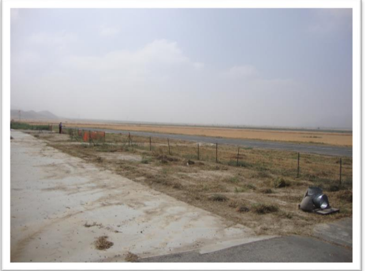
It looks so much better now!