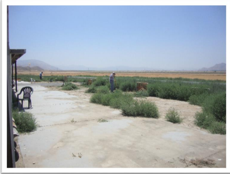
This is how it looked when they started.

If I missed anyone, please accept our apologies, and know that we really appreciate your efforts!