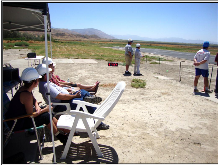
Lap Counter “Pickle” Button Operators (Lap Count Display in the background)