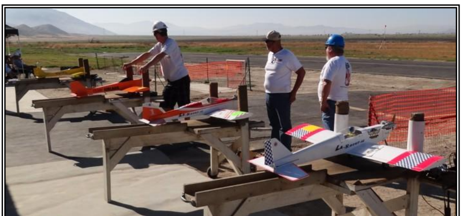
Four Racers at the Start Line, ready for "Pilots, Start Your Engines".