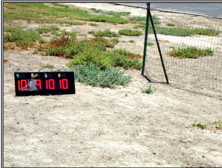
Close-up of the Lap Count Display Left to Right: Low Green, Low Orange, High Green, High Orange.