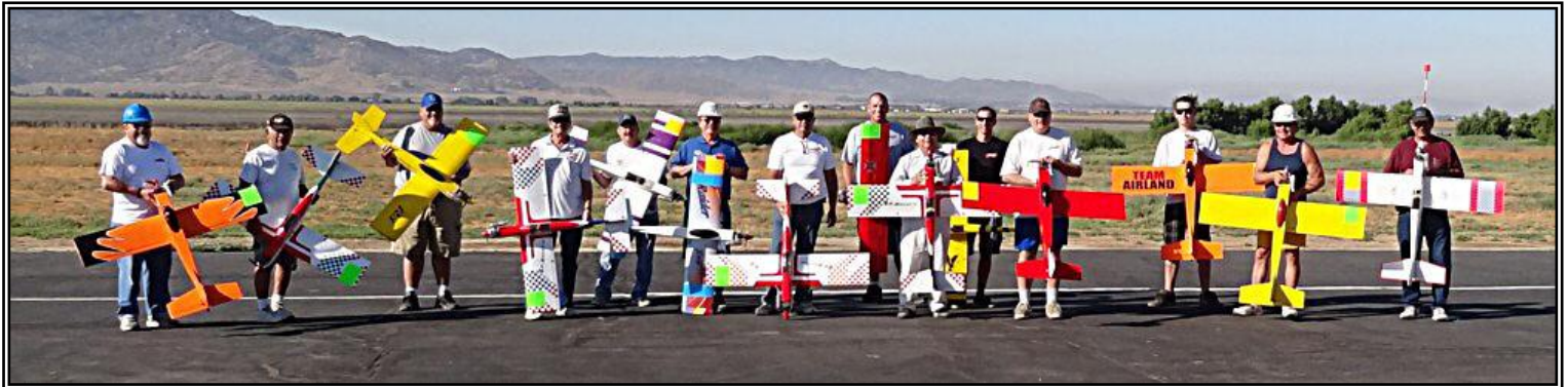
The Fourteen Race Pilots ready to Rumble!

A VERY SUCCESSFUL AND ENJOYABLE EVENT – THANK YOU, RACE PILOTS AND WORKERS!!!